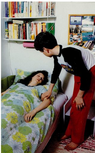
FIGURE 3 | A boy is waking up a girl (Stark, 1998).