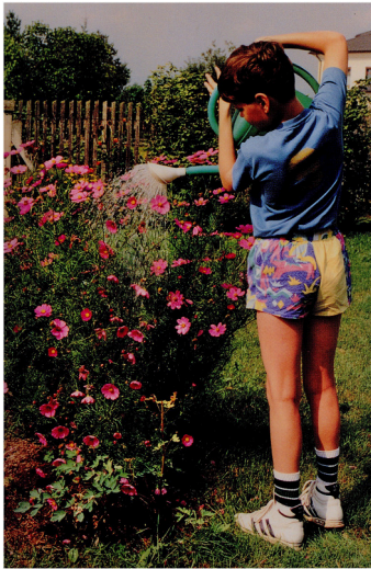
FIGURE 7 | A boy is watering flowers (Stark, 1998).