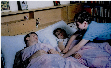
FIGURE 12 | A boy is waking up his father (Stark, 1998).