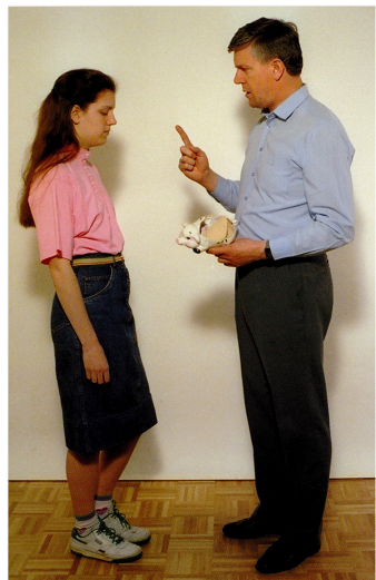
FIGURE 8 | A man scolds a girl (for breaking the piggy bank) (Stark, 1998).

The picture: A man scolds a girl (for breaking the piggy bank).