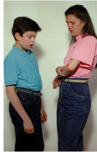
FIGURE 4 | A girl is showing her scar to a boy (Stark, 1998).