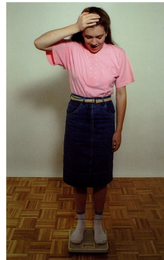
FIGURE 10 | A girl is standing on the bathroom scales (Stark, 1998).

(c) Descriptive clause with recursive embedding ( that -clauses): Figure 10 .