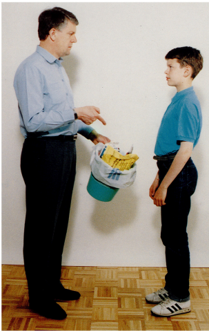
FIGURE 1 | A man orders a boy to take the garbage out (Stark, 1998).

categories between two groups (i.e., a group of participants with impairment and a group of healthy controls)-, and we will provide the level of significance and effect size (in terms of Cramer's V ). Analyses were performed using IBM SPSS Statistics software, version 22.0.0.0.