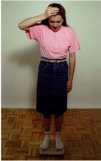
FIGURE 2 | A girl is standing on bathroom scales (Stark, 1998).