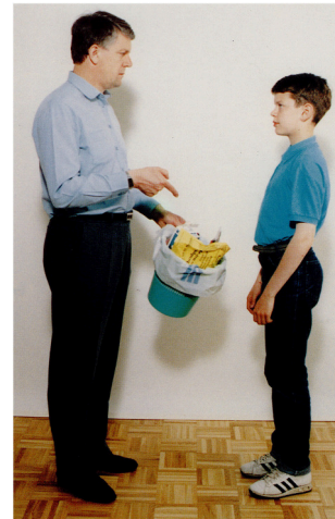
FIGURE 9 | A man orders a boy to take the garbage out (Stark, 1998).